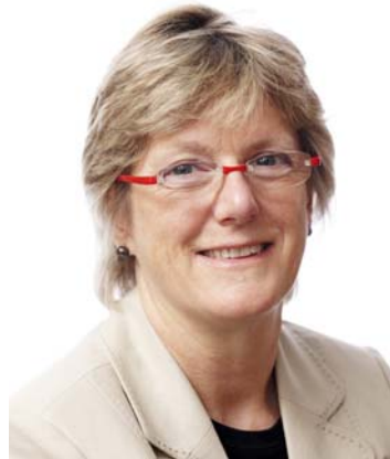
Dame Sally Davies

Health and social care research matters to each and every one of us. It underpins the quality of our health and care services and makes a vital contribution to health outcomes and our quality of life. All of us have the high expectation that we will be offered cutting-edge treatments and world class care when we, or our friends, or family, are ill or vulnerable. Delivering the best possible health and care relies on having the best possible research evidence.